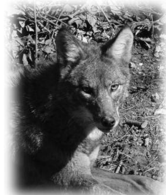
MDWFP: R. Flynt

Note: For pelts or carcasses that will be frozen prior to tagging. It is recommended that an object, such as a wooden dowel or plastic tube of sufficient size, be placed through the eye-hole of pelts or eye-hole and upper lip of carcasses before freezing. When the frozen pelts or carcasses are tagged, removal of the object will provide an opening to facilitate application of the tag. Frozen pelts should be rolled in a fashion to obtain easy access to the head area.