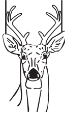
10" Inside Spread