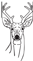
12" Inside Spread